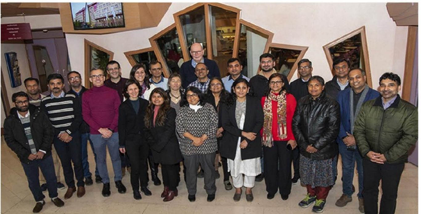
Building Resilient Urban Communities partners of EU Erasmus + project BReUCom and first secretary of Embassy of India visit University of Twente.